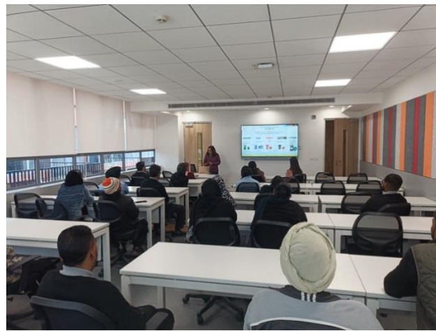
Training Sessions to Faculty Departments