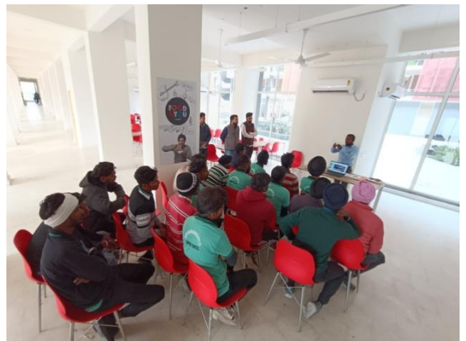
Training Sessions to Housekeeping staff at various locations