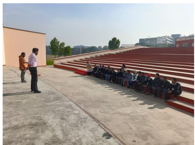
Training sessions, Plogging activities, Waste Management sessions & Recycled Products stall