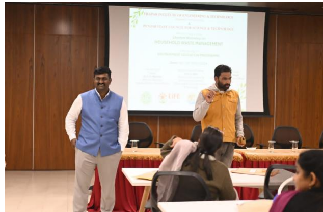
Waste Management Workshop conducted at TIET