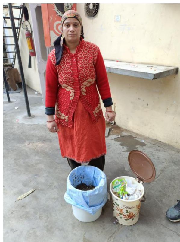
Segregated Waste – Food outlets