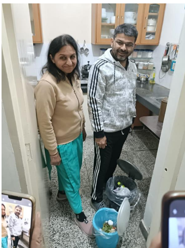
Segregated Waste – Households